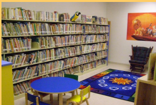
Children's Reading Room at the Charles City County location.

As our counties grow, it is very important that our libraries do also. Please take a moment to become a member of Friends of Heritage Public Library and show that our library is important.