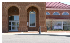
Charles City branch located inside the Charles City County Court-house building.