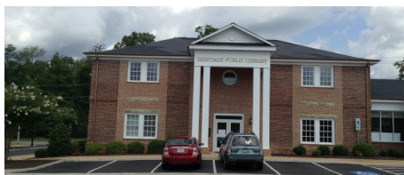
New Kent branch located at 7791 Invicta Lane.

We bring like-minded people together to support, improve and promote our local libraries and the services they provide for the citizens of New Kent and Charles City Counties.